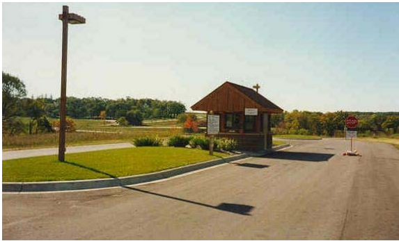
Chester Woods Park Entrance

The county entered the park business in 1968 when the State of Minnesota turned Oronoco State Park over to county management. From that 33 acre 8 campsite beginning, the system has expanded to 4 major parks and a number of smaller facilities totaling 2100 acres and providing outdoor recreation and educational opportunities to South-eastern Minnesota.